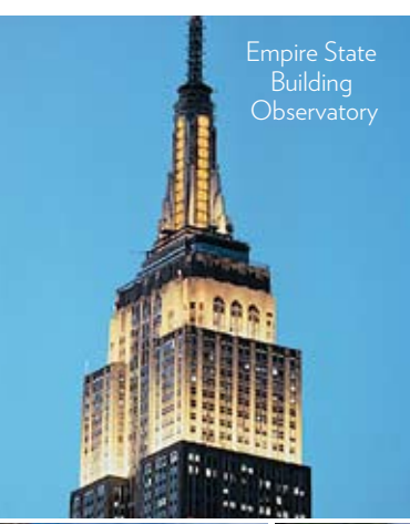
Skip most ticket lines Valid up to 9 days