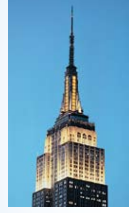
Open daily (877) NYĆ-VIEW esbnyc.com

The iconic Empire State Building offers panoramic views of the New York skyline day and night. Rising 1,050 feet above Manhattan, enjoy views from the 86th Floor Observatory while you are treated to an audio tour explaining the sights and sounds of the city. Day or night, there's always a breathtaking view of New York from the glass enclosed observatory or the open air deck.